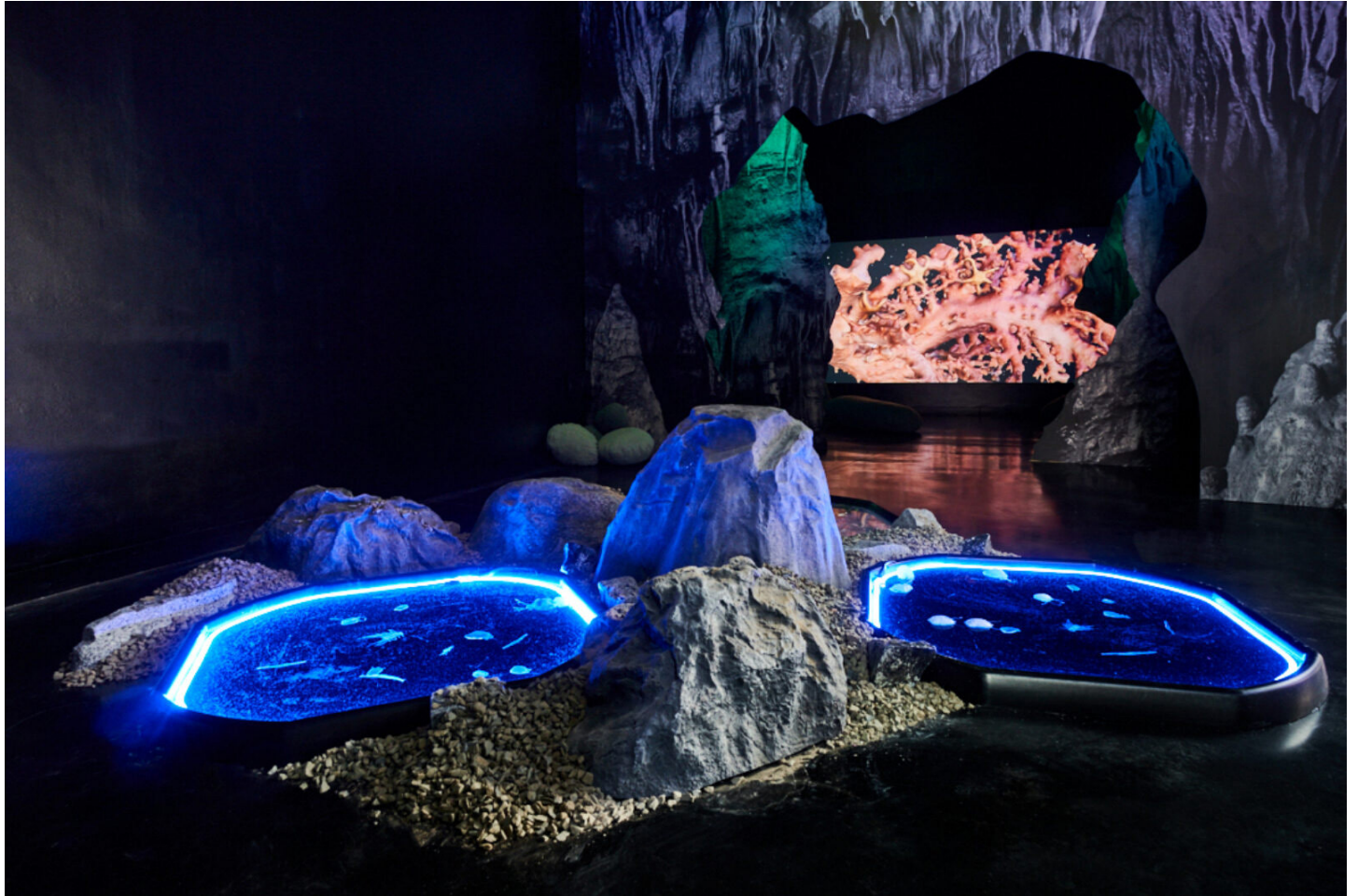
Josèfa Ntjam, When the moon dreamed of the ocean , 2022 Installation view at FACT Liverpool.