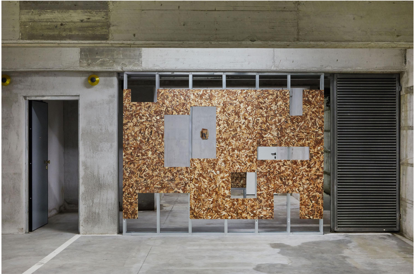
Olu Ogunnaike, From one space to an/other , 2020 Villa Lontana, Rome. IT.