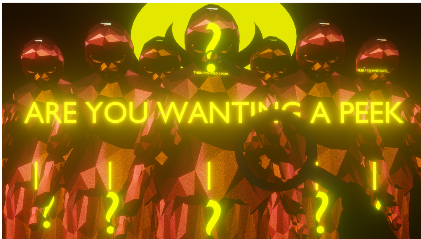
Danielle Brathwaite-Shirley, Before They Were None , 2023